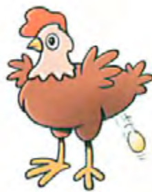
lay an egg